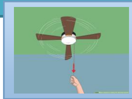
Switch off the fan!