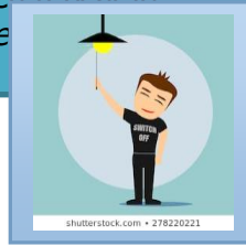
Turn off the lamp!