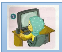
Switch off the computer!