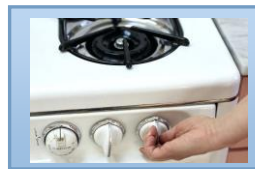
Turn off the stove!