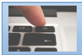
Shut down the computer!