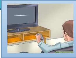
Turn off the TV !

(Dengarkan gurumu membacakan beberapa nama benda berikut ini dan ulangi!)