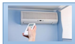
Switch off the AC!